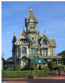
THE CARSON MANSION

For many ARS members, seeing the Redwoods ( Sequoia sempervirens ) is high on the must see "bucket list", as are the rugged North Coast of California with its Rhododendron macrophyllum and Stagecoach Hill, the home of the Smith-Mossman 1966 collections of Rhododendron occidentale azaleas.