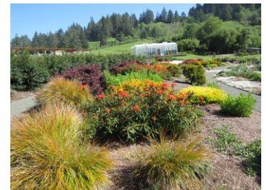
HUMBOLDT BOTANICAL GARDEN

From the north, PenAir flies from Portland, Oregon to the Eureka/Arcata airport. An alternative to flying directly to Eureka from Portland might be to fly to Crescent City or to Medford, Oregon, then rent a car. Drive time from Crescent City is about two hours; from Medford about four hours. Both routes are quite scenic, with wild rivers, rugged mountains and redwood forests well worth visiting. Several car rental agencies operate at the Eureka/Arcata airport. The Red Lion Hotel offers free shuttle service for convention attendees to and from the Eureka/Arcata airport. However you choose to get here, we look forward to hosting you and showing you our beautiful northwest corner of California.