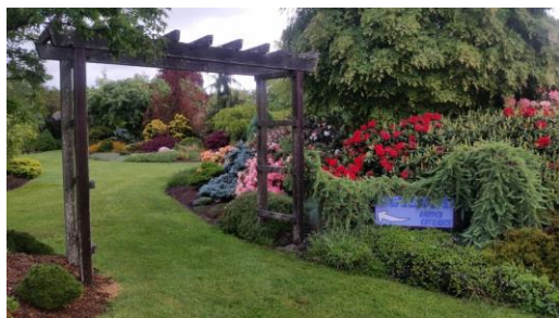
SINGING TREE GARDENS

Eureka is served by United Express twice daily from San Francisco. Flying to San Francisco and transferring to Eureka is the usual air transport option. Renting a car in San Francisco and driving to Eureka is a very scenic alternative. Drive time from San Francisco is about seven hours through the wine country with its rolling hills and on north through the Coast Range mountains and redwood forests.