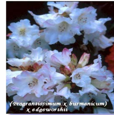
Left “Coastal Spice”