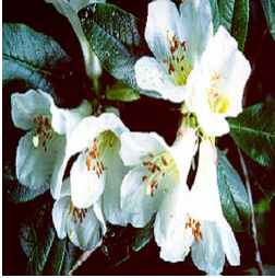
Right Rh. Polyandrum

Eureka Chapter/American Rhododendron Society 2050 Irving Drive Eureka, CA 95503-7022