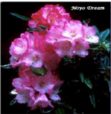
Right “Noyo Dream”