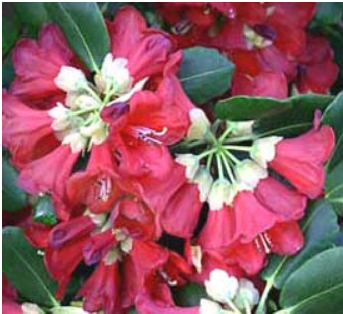
The drawings at right show some different types and shapes of Calyces. The photo at left is of Rh. Thomsonii ssp. thomsonii showing its tan calyx

This month's word is calyx. It comes from the Greek word Kalyx, a husk or a cup. The word for a cup, chalice, descends from the same root via the Latin calix. The calyx is the outer group of modified leaves that usually surround the reproductive parts of a flower. Typically, the calyx is green and not brightly colored, but it can be brightly colored, especially in hybridized flowers. It is usually divided into separate parts called sepals (Latin: a covering) which enclose the flower bud before it opens. When the flower opens the inner group of modified leaves, the corolla (Latin: corona, a crown) is revealed. Usually the corolla is brightly colored, often with distinct ultra-violet marks, to attract pollinators. Most of the time the corolla is divided into separate petals (Greek: petalon, a leaf) which often have scent glands at their bases to attract insects and other pollinators such as birds. The scents can be sweet to attract such pollinators as bees, or rotten to attract flies, as with the carrion flower Jim Gayner brought to the September meeting. When sepals and petals cannot be told apart, they are all called tepals ( a made-up word with no Latin or Greek origin). Often plants derive their scientific names from these flower parts as in Rhododendron cilicalyx , "red tree with a hairy calyx". Submitted by Bruce Palmer