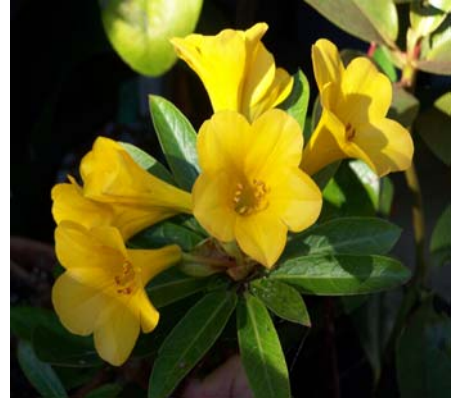
Rh. Laetum from Tim Walsh's vireya collection.

Gonsea Restaurant 2335 4th Street, Eureka Call Nelda to make your reservation 707-443-8049