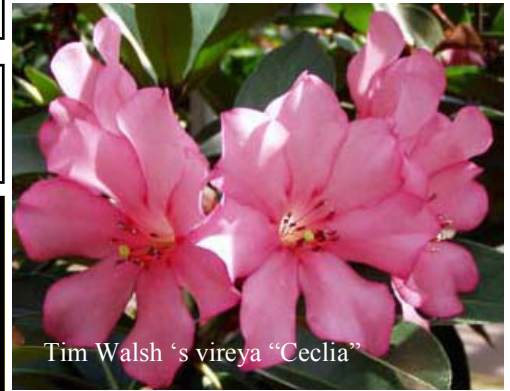
Tim Walsh's vireya "Ceelia"

5:15 pm at Sea Grill 316 E Street, Eureka To ensure a seat call Nelda 443- 8049 for a reservation