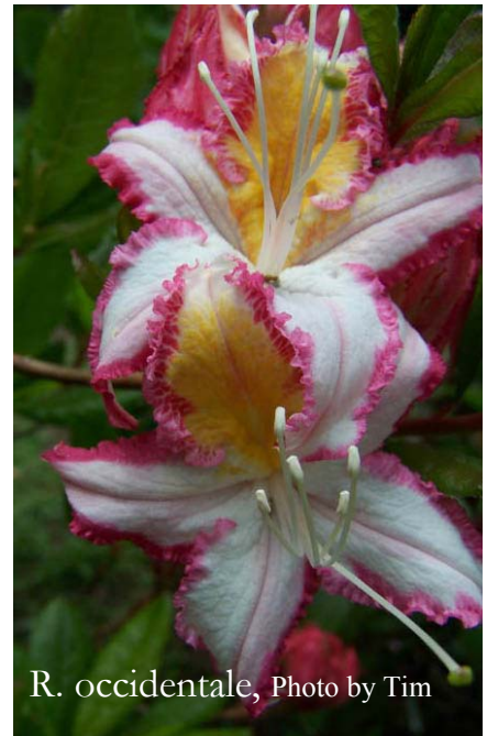
R. occidentale

Toilets are available at Singing Tree Gardens, no toilets at the Azalea Reserve nor at the Wells' garden. We will stop at the highway rest stop.