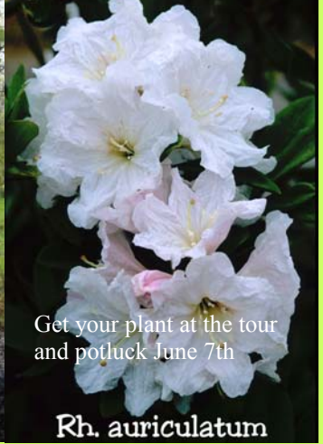
Get your plant at the tour and potluck June 7th