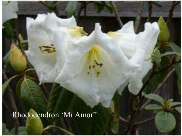
Rhododendron 'Mi Amor'