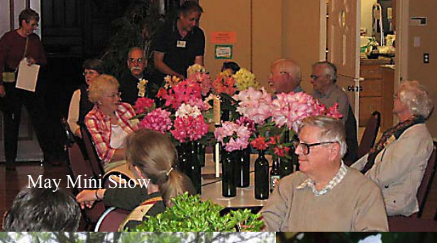
May Mini Show