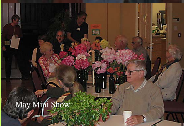
May Mini Show