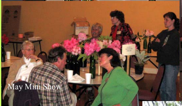
May Mini Show