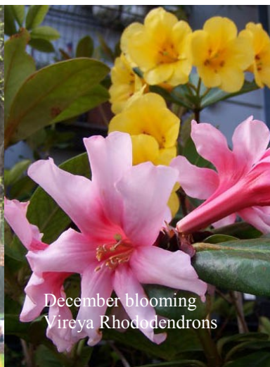
December blooming Vireya Rhododendrons