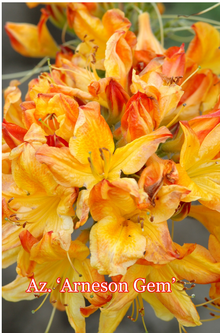
Az. 'Arneson Gem'