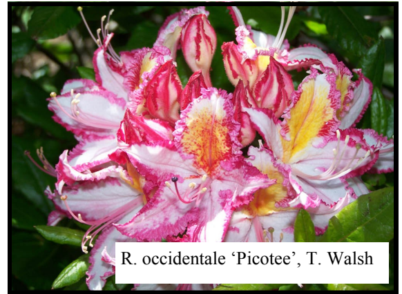
R. occidentale 'Picotee', T. Walsh

Potluck BBQ at Humboldt Botanical Garden 2:30 p.m.