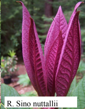
R. Sino nuttallii