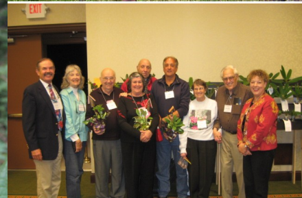
Eureka Chapter at Florence Conference