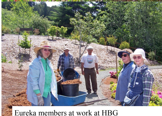
Eureka members at work at HBG