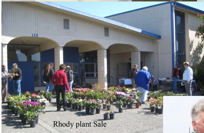
Rhody plant Sale