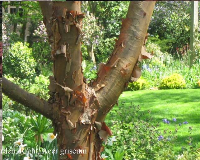
Left, Portland Japanese Garden. Right, Acer griseum