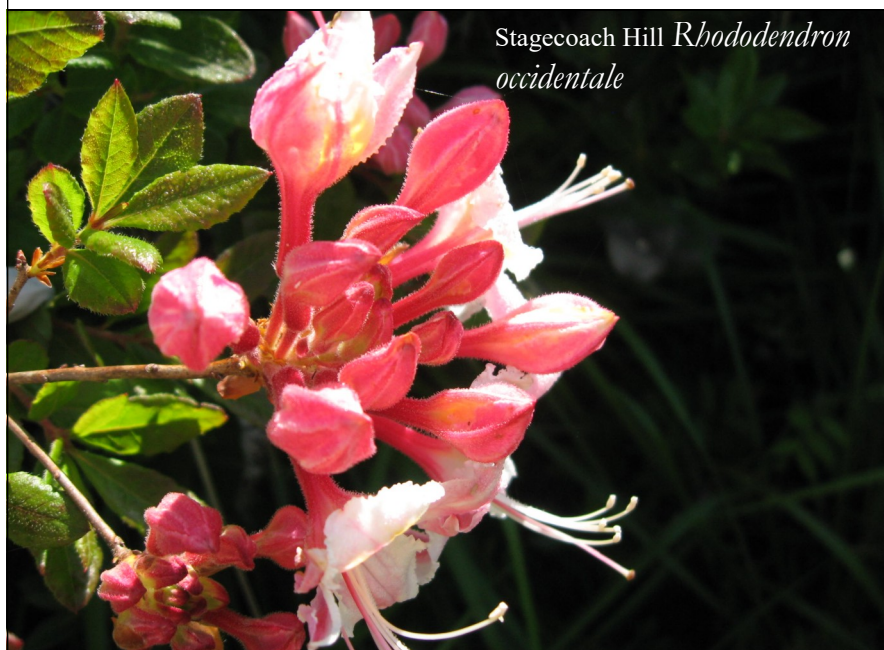
Stagecoach Hill Rhododendron occidentale