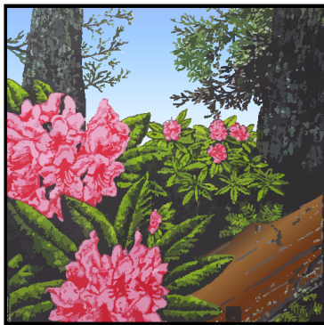
Eureka Chapter American Rhododendron Society