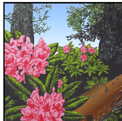
Eureka Chapter American Rhododendron Society