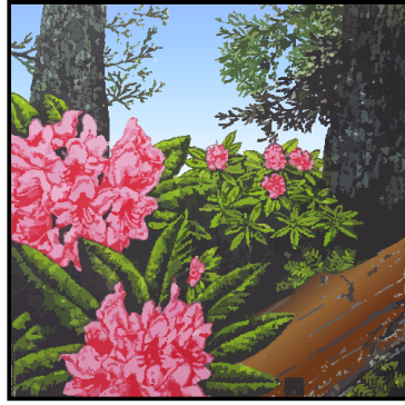
Eureka Chapter American Rhododendron Society