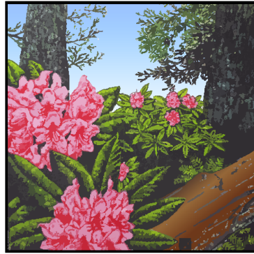
Eureka Chapter American Rhododendron Society