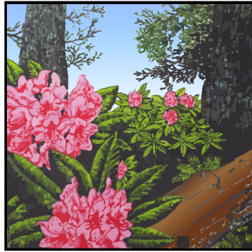
Eureka Chapter American Rhododendron Society