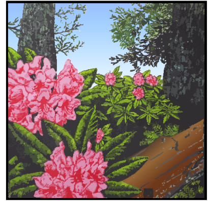
Eureka Chapter American Rhododendron Society

The next meeting, IN-PERSON! Thursday September 22, 7:00 p.m. Woman's Club 1531 J Street, Eureka CA