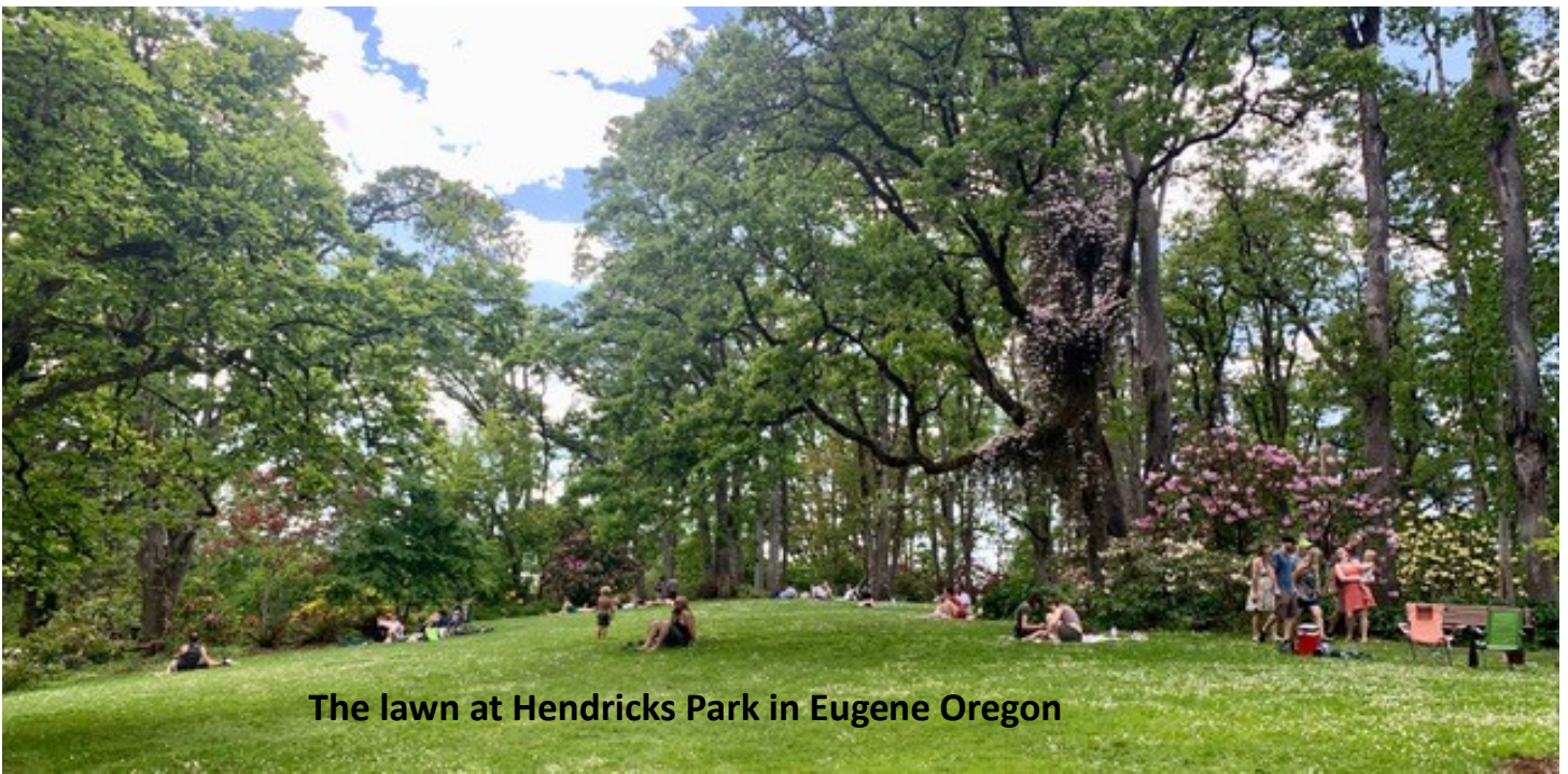
The lawn at Hendricks Park in Eugene Oregon