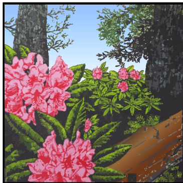
Eureka Chapter American Rhododendron Society

Eureka Chapter is a chapter of the American Rhododendron Society a 501 (c) (3) charitable organization.