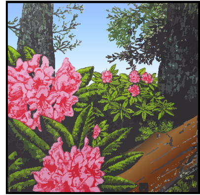
Eureka Chapter American Rhododendron Society

The next meeting Thurs. March 27th 7:00 pm Eureka Woman's Club 1531 J Street, Eureka CA