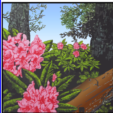
Eureka Chapter American Rhododendron Society