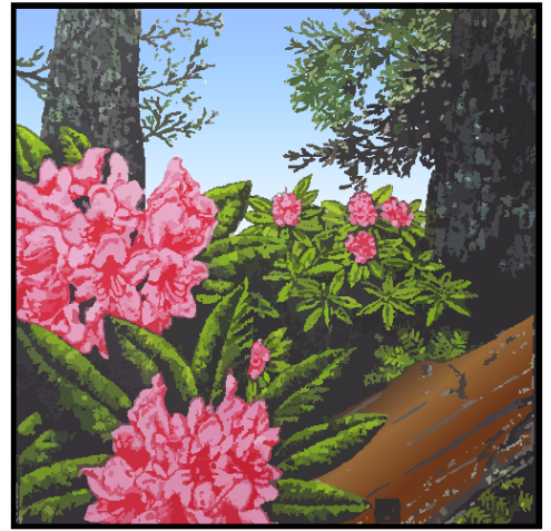
Eureka Chapter American Rhododendron Society

Eureka Woman's Club, 1531 J Street, Eureka